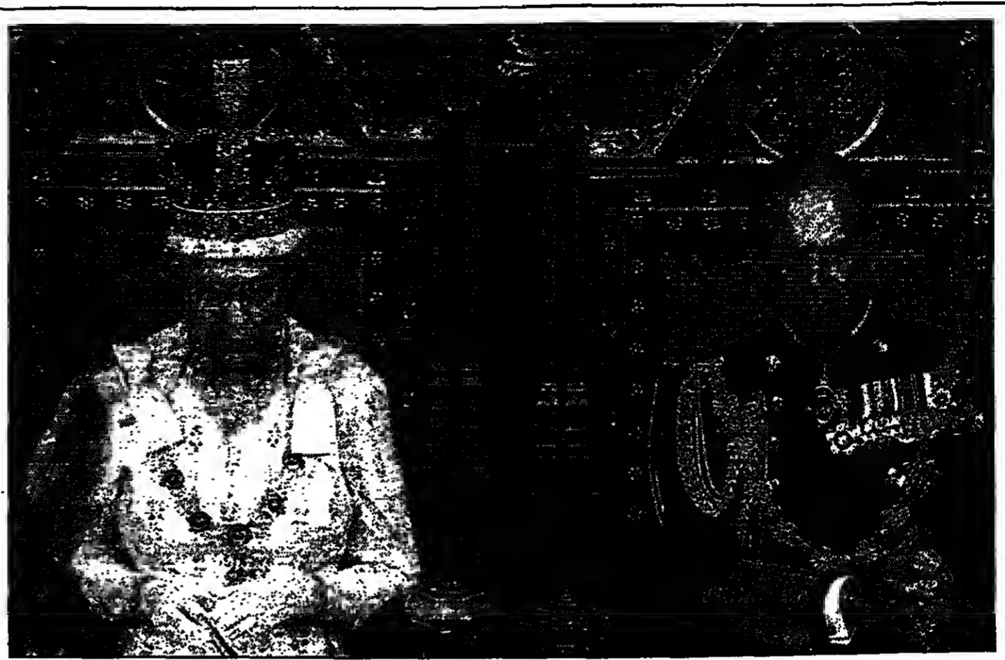
Queen Elizabeth II, accompanied by Prince Philip, sits in the House of Lords yesterday at the opening of Parliament.

"The alliance may not feel the need to deploy additional troops," he told a news conference, saying that was for NATO alone to decide.